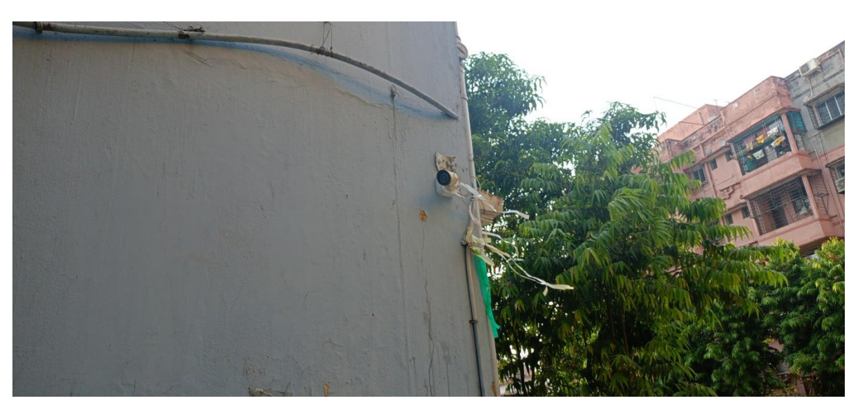
CCTV Cameras in various areas