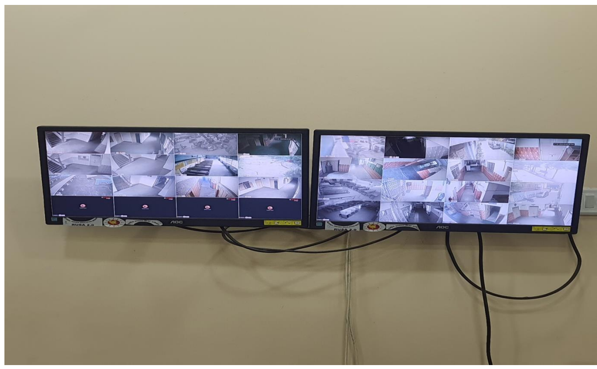
LCD to monitoring CCTV